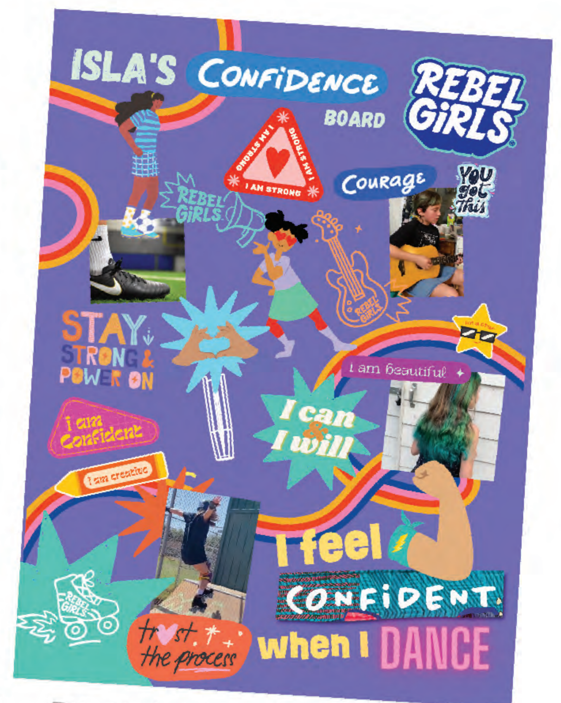
Digital Vision Board

Mind, Body, Family, Community, And World Some people are confident at school but not confident in the bigger world. And some people might feel confident about how they show up in community but lack confidence in their own body. Think about where you feel most confident.